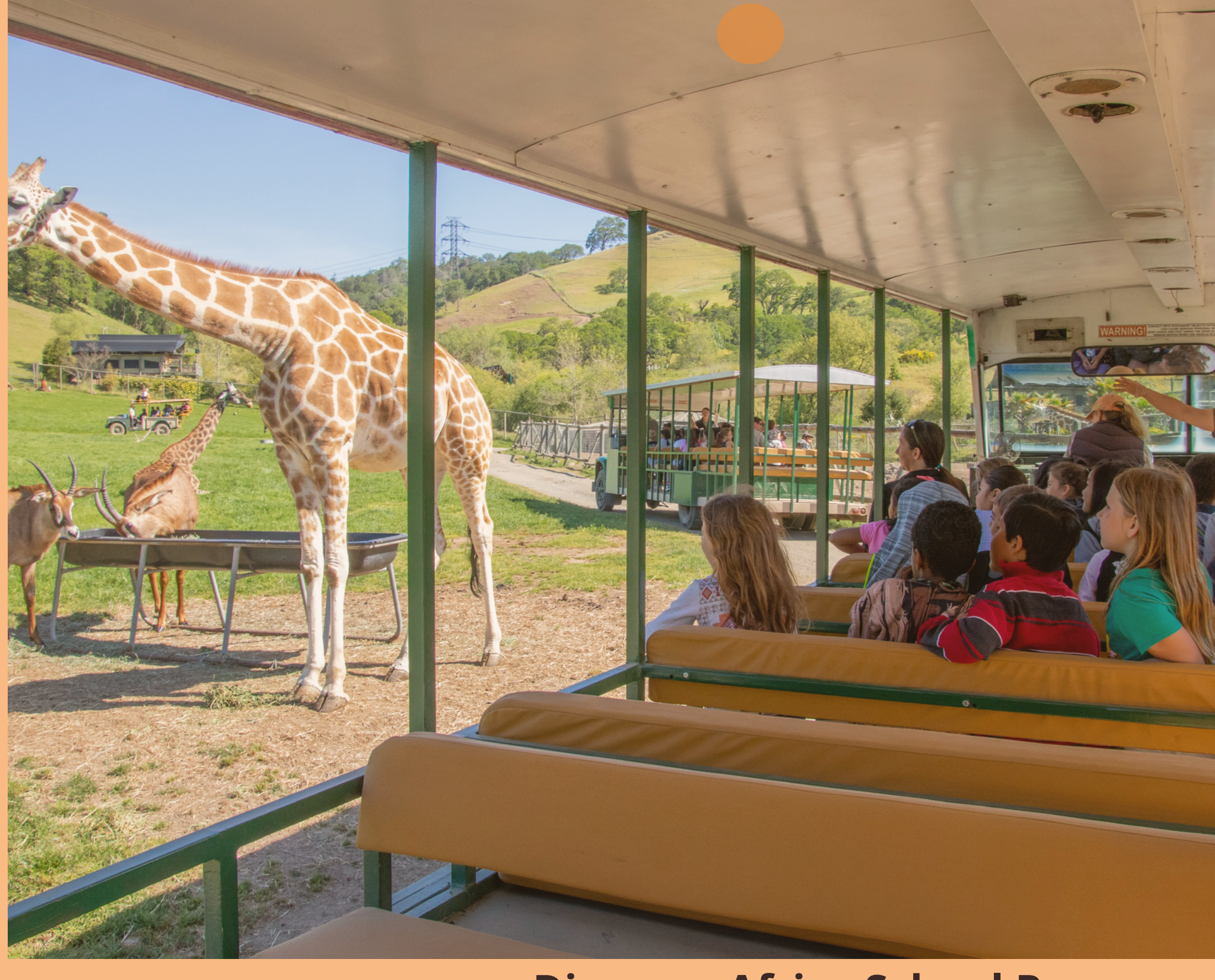
Discover Africa School Program

Working in close partnership with the Safari West Wildlife Preserve, the Foundation provides opportunities to engage children, their families, and educators to become stewards of wildlife.