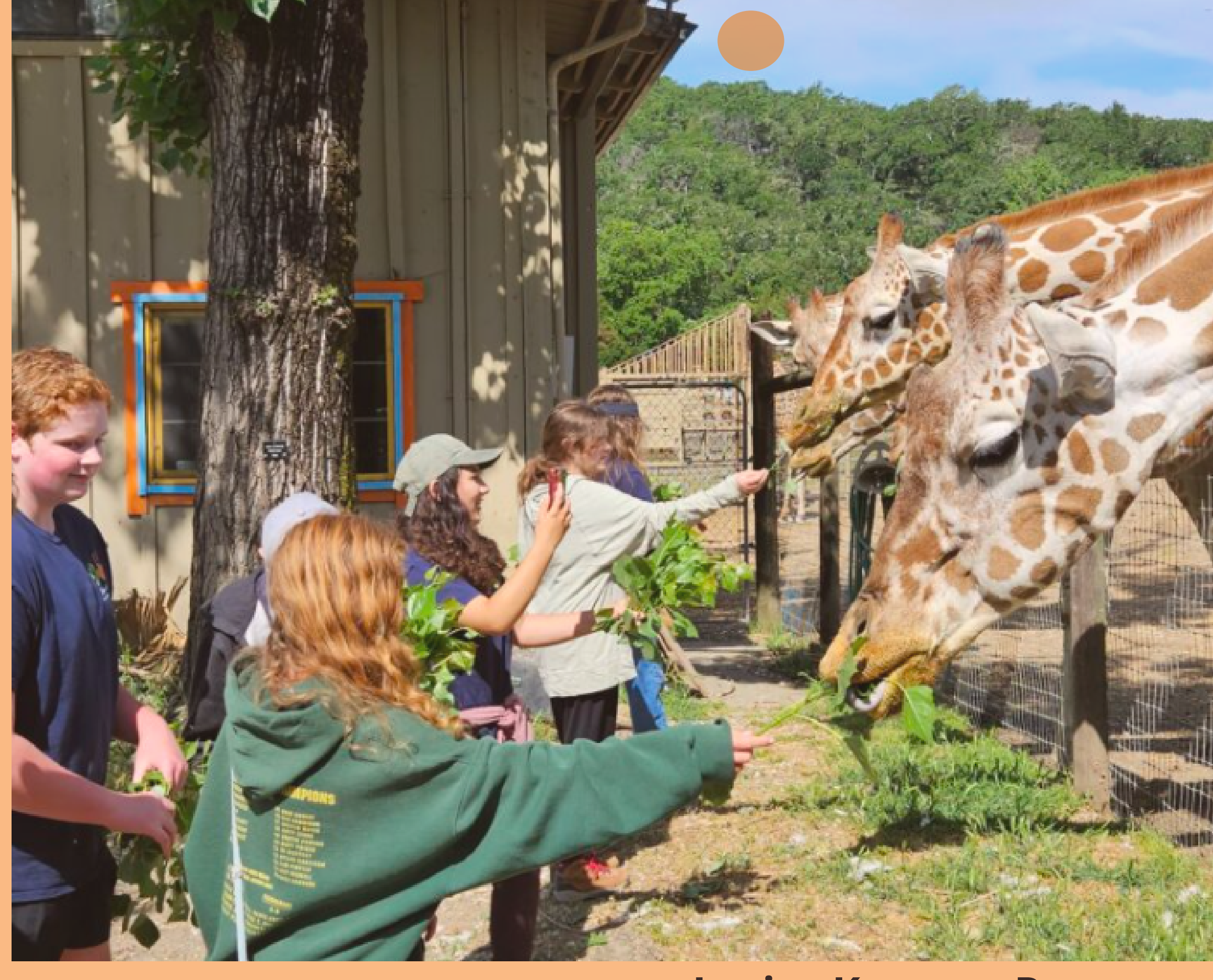
Junior Keepers Program

Safari West LIVE Junior Keepers Discover Africa